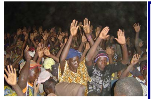
Each night hundreds respond to the gospel

Typer Volta Crusade: Steep increases in the price of food resulted in riots prior to the crusade. Even though the people could not afford bread, the Bread of Life was a free gift. Burkina Faso has been a battleground for more than a thousand years as the Mossi Kingdom defended its religious beliefs and customs from invading Muslims across the Mali border. In this unsettled land we conducted a crusade with hundreds of people responding to the gospel each night.