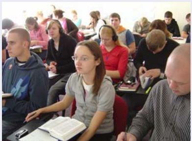
Students of New Bible School A new generation of leaders